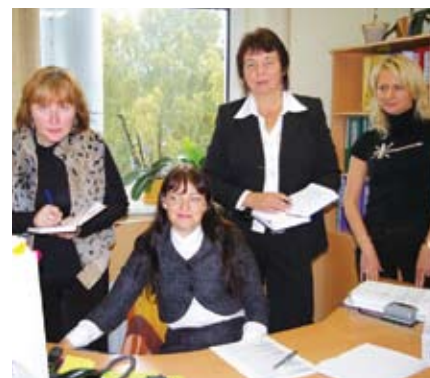
During the seminar

future it is planned to pass the information necessary for work to chief accountants of other affiliates, also to carry out consultations for accountants that already participated in the seminar.