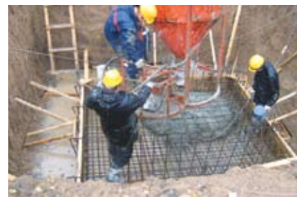
Building of the regional distributive centre in Sagittarius village, Tambov region

Joint-Stock Company “Tander», Management Company of “Magnit” chain of stores was founded in 1994. At the moment JSC “Magnit” is the largest food retailer in Russia in terms of number of stores and their geographical coverage, there are 57