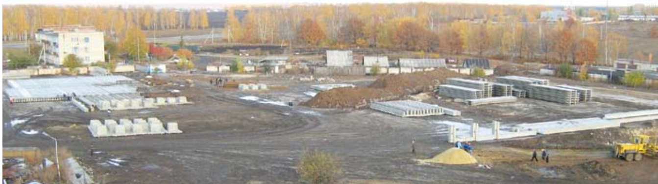
The building up space covers 12,5 hectares

regional branches, more than 2864 shops in more than 922 cities. Presently some tens of new shops start operating every month. About 73 556 employees work in a chain. Assortment of “Magnit” stores accounts for 500 Private Labels. Selling space varies from 2,000 to 12, 500 sq. m. Assortment consists of up to 15,000 names of goods out of which about 75% are food items. Magnit hypermarkets are located in the inner city which makes them accessible not only by car owners. Another 10 objects are under construction. In addition the company also has its own fleet and carries out transportation of cargoes through the entire European part of Russia.