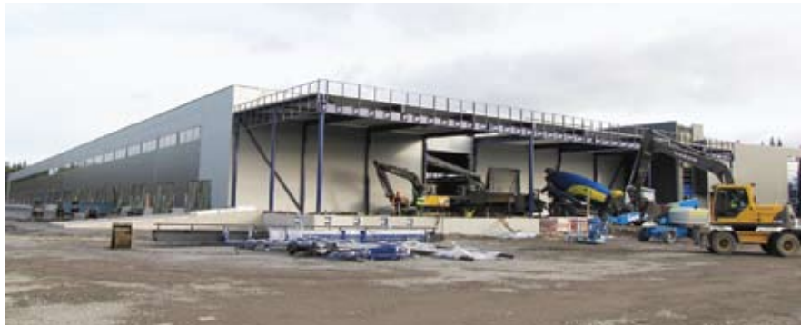
Building of logistics terminal "Kaukokiito" Oy, 10000 m 2 , in Turku

On November, 9th 2009 specialists of the Group will start construction works of