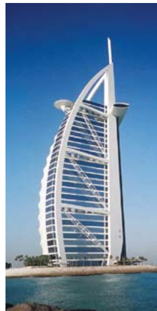
Hotel Burj Dubai al Arab Hotel figuratively is called «Seven-stars». It is the highest hotel in the world (56 floors, 321 meters) is erected in the sea, in 280 m from coast on the artificial Island. The hotel is located in 15 km to the south of Dubai and is part of Jumeirah International complex.

Dubai is the 3rd re-export centre in the world after Hong Kong and Singapore. During the last years obvious building boom is observed in Dubai. One significant fact testifies it: the fifth part of all tower cranes of the world concentrates in the territory between Abu-Dhabi (capital of United Arabian Emirates and emirate Abu-Dhabi) and Dubai.