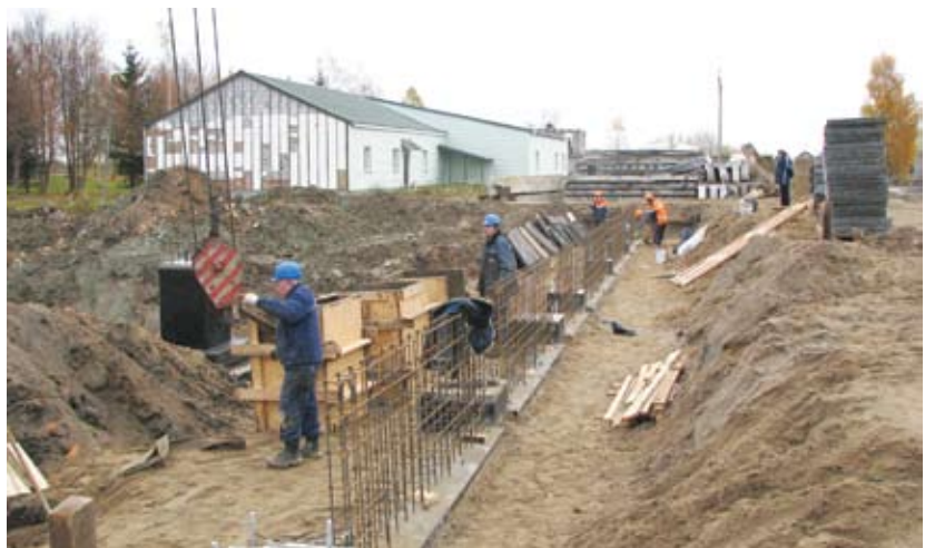
Construction works of factory manufacturing medicine JSC "Infomed"

Construction of energy (city) park (the area of 1845 m 2 ) will begin in Ussikaupunki, Finland in November.