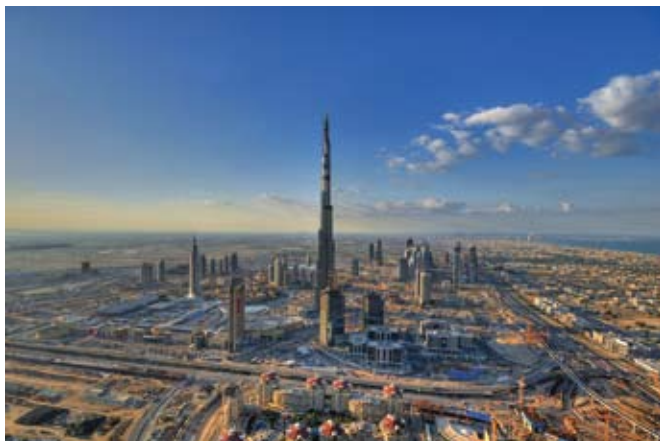
The Burj Dubai, the grand construction with complex of living, commercial, hotels, entertainment and shopping centers all around water, verdure and lakes. The Burj Dubai is the tallest man-made structure in the world (tower of Dubai): from 160 to 180 floors. Dwelling and commercial premises as well as luxury hotel will be in the tower.

Dubai is the largest city in United Arab Emirates (UAE), an administrative centre of emirate. The name of emirate translates from the Arabian as "a locust hatched out of larva".